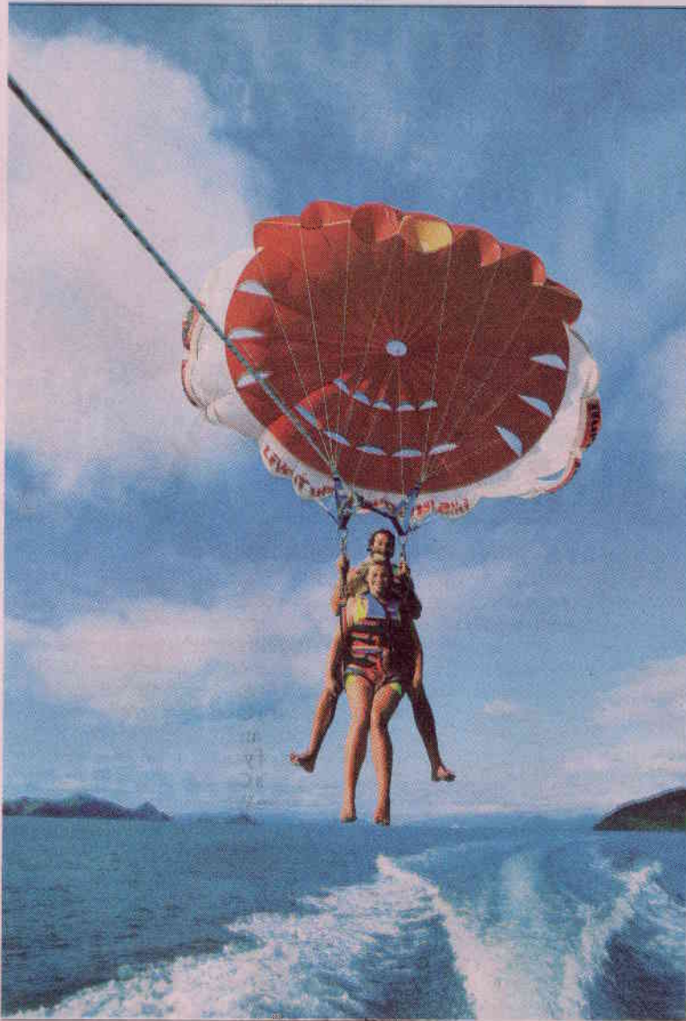
The Cruise Whitsundays pontoon at Knuckle Reef offers Seawalker, a modern version of the old diver's