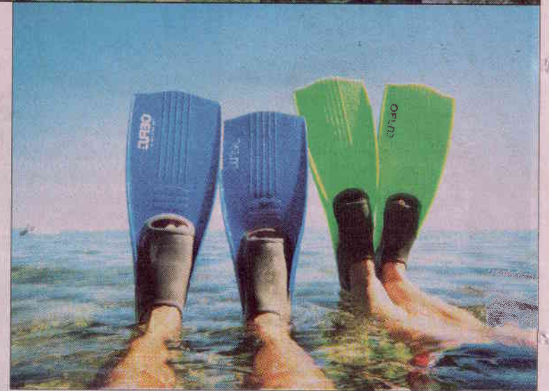
PUT YOUR FEET UP: (opposite page) Cruising in the Whitsundays; (this page, clockwise from above) the islands offer scuba diving, parasailing, destinations such as Long Island and even rainforest massages on Hayman.

Sample three islands on an escorted island discovery cruise. Catch some action on Hamilton, relax and unwind