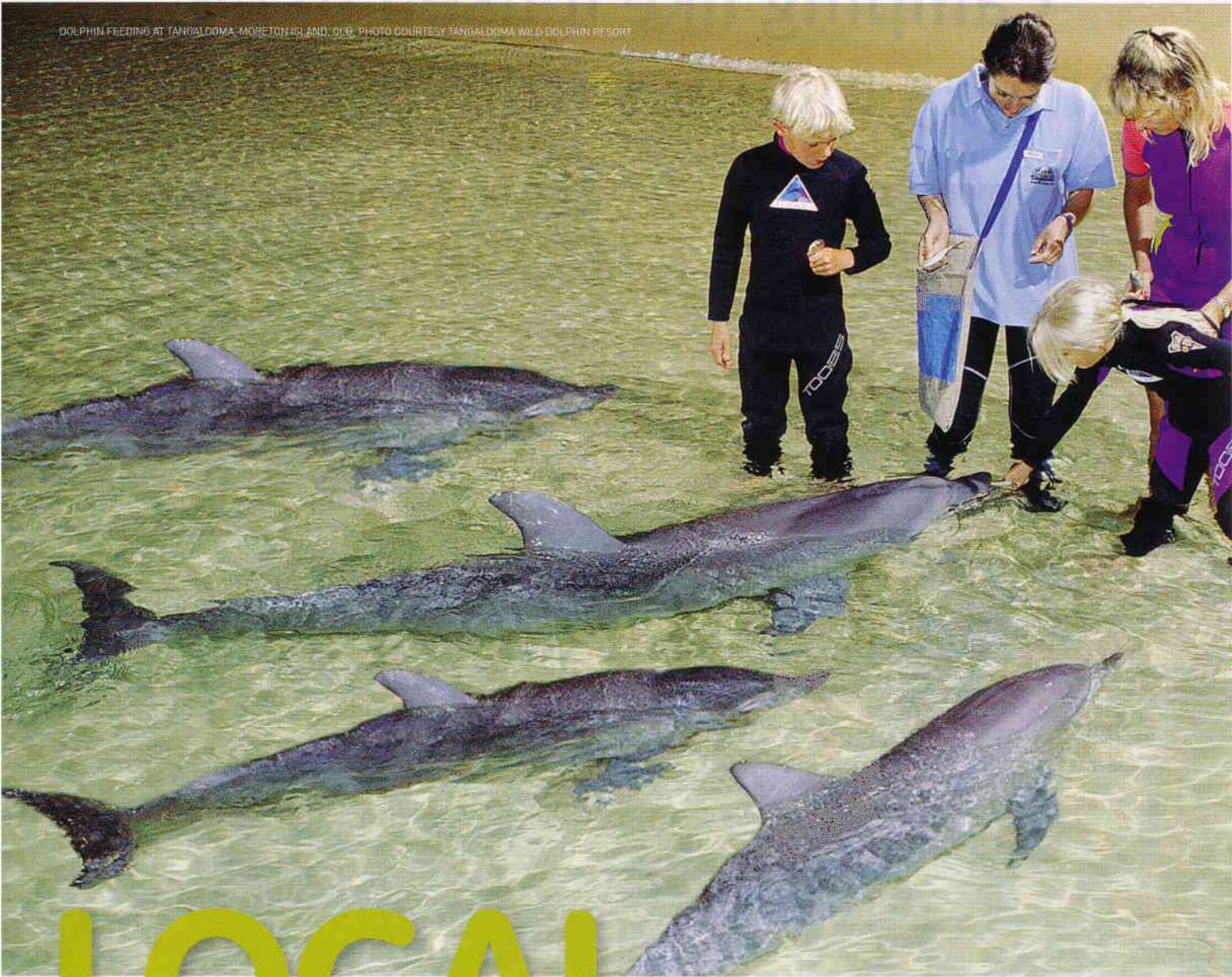
DOLPHIN FEEDING AT TANGALOOMA, MORETON ISLAND, QLD.