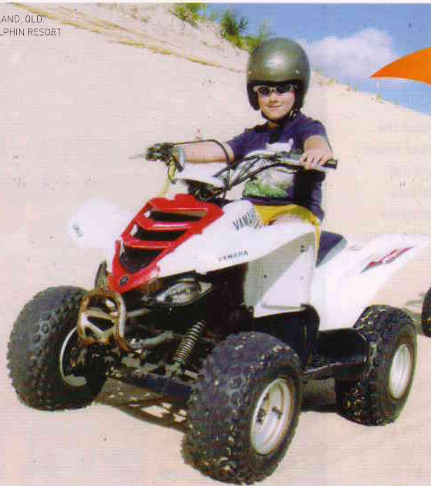
QUAD BIKING AT TANGALOOMA, MORETON ISLAND, QLD.

Our kids couldn't believe [Dangar] island residents get around without cars.