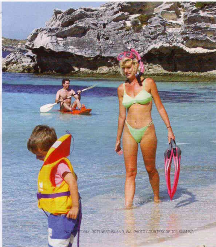
PARADISE BAY, ROTTNEST ISLAND, WA.